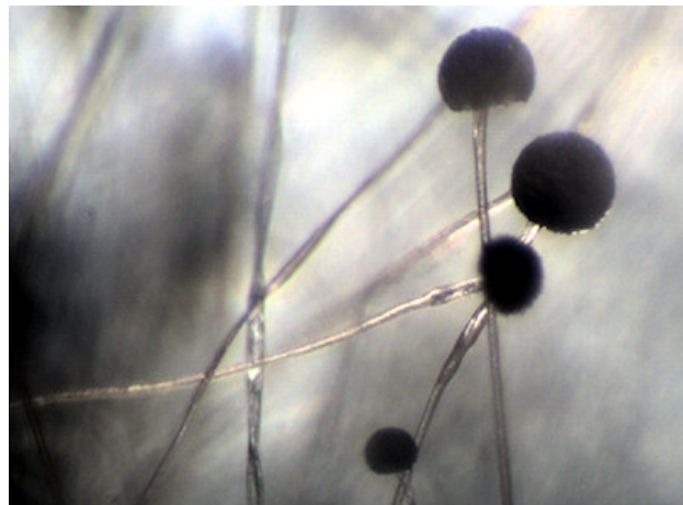
Sporangia of Rhizopus oryzae on overripe tempeh