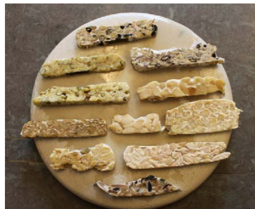
Assorted tempe tasting: bean and pea varieties Guixer, 2015 5