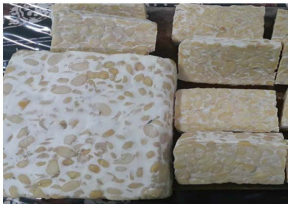
Fresh tempe (fermented soybean cake) Surono, 2016 2

Tempe is classified as a compact cake-form product which is prepared from dehulled soybeans through fermentation with Rhizopus spp. by Codex. 1 This product originated in Indonesia and the earliest reference to this traditional ethnic food dates back to the 1600's. 2 It is an affordable protein staple in Indonesia, also common in the Netherlands, where there is a large Indonesian sub-population. The alternate spelling, tempeh, is derived from the Dutch. 2 Tempe has some interesting nutritional characteristics; fermentation renders the soybeans more digestible (via reduction of flatulence inducing oligosaccharides), 3 inhibits phytic acids commonly known as anti-nutrients thereby increasing mineral bioavailability, increases the vitamin B 12 and folate content, and tempe researchers have shown this food has antibacterial affects, such as reducing adhesion of enterotoxigenic E. coli . 2,4